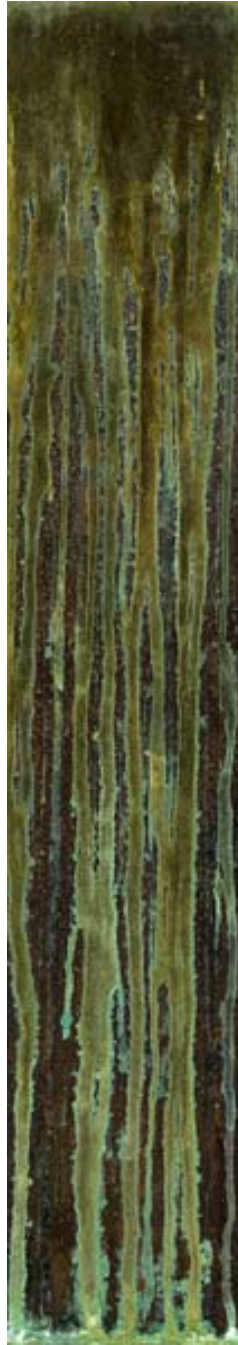
6. Without Title , 1994-2009 Activated 1994; photographed February 2010 Copper, ammonium chloride copper sulfate 14 x 3 x \frac{3}{4} inches; Collection of the artist