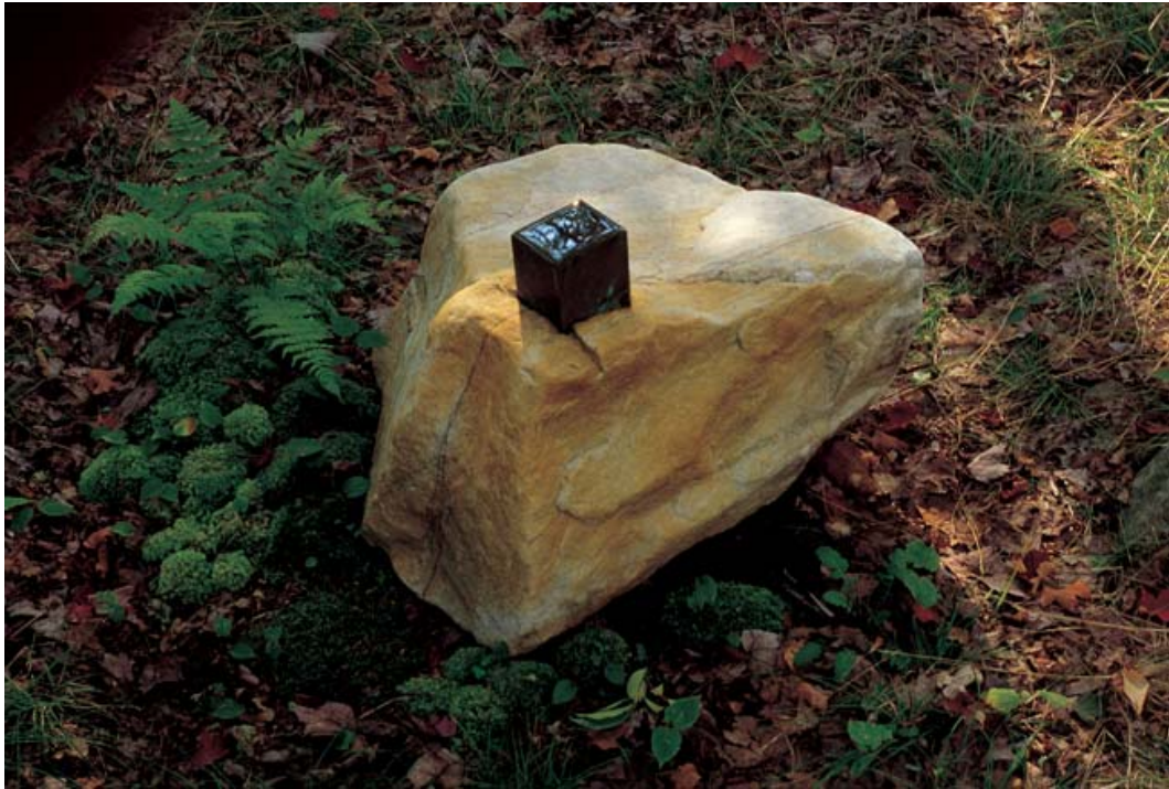
8. Notation IV , 1999 Activated August 1999; photographed June 2000 Quartzite, copper; 22 x 21 x 36 inches; Collection of the artist, Laporte, Pennsylvania