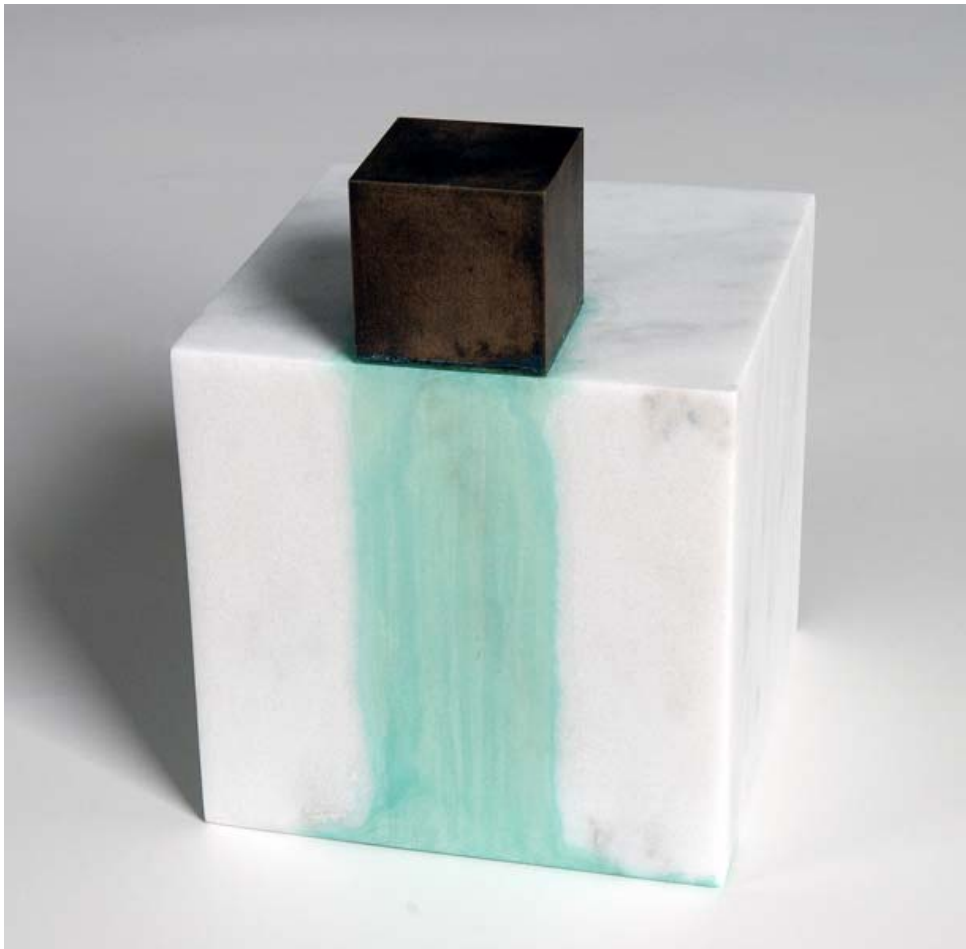
5. Notation XI , 2010 Activated and photographed April 2010 Vermont marble, bonze, ammonium chloride copper sulfate solution 10 x 7½ x 7½ inches; Collection of Andrea Krantz and Harvey Sawikin, New York