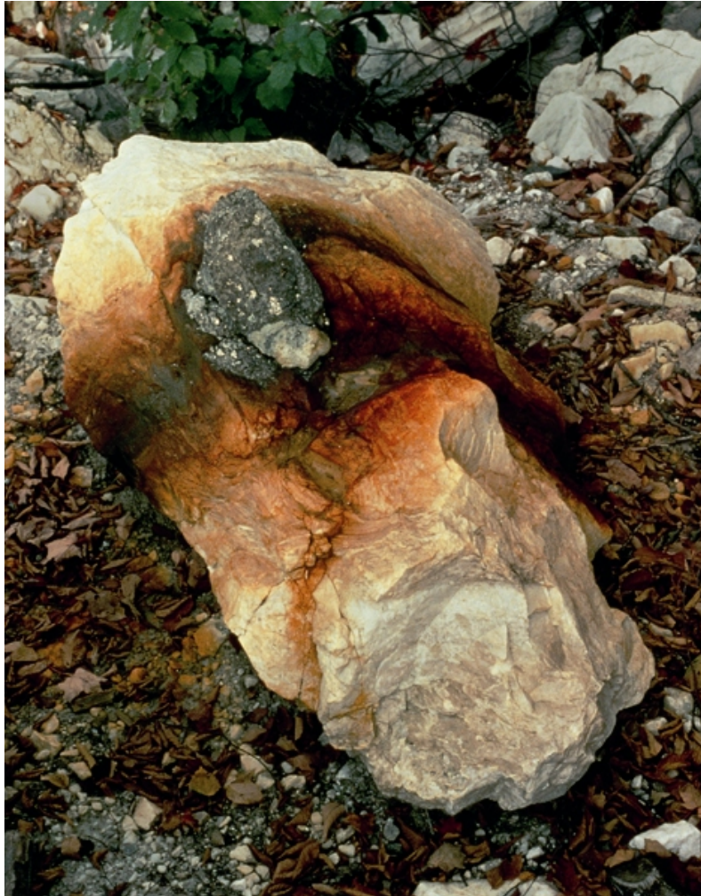
19. Indeterminacy XV , 1997 Activated July 1997; photographed July 1998 Vermont marble, pyrite, 24 x 96 x 40 inches Fields Sculpture Park, Art Omi, Ghent, New York