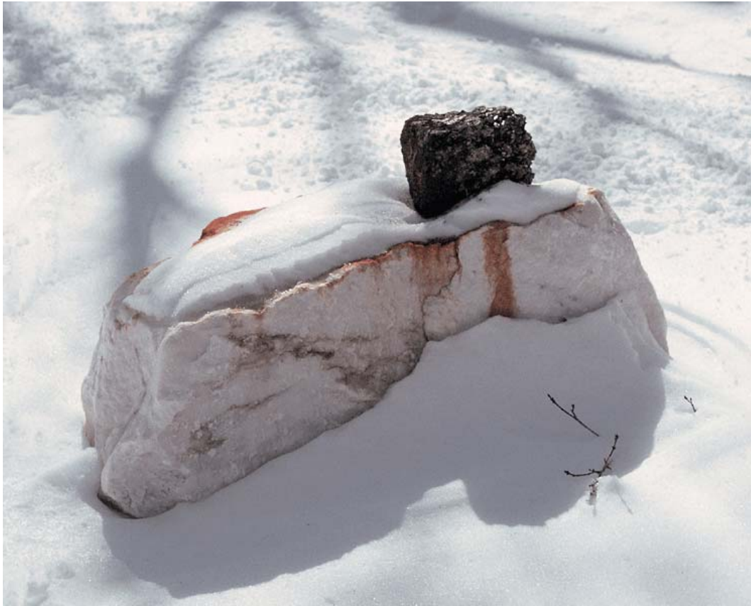
14. Indeterminacy III , 1995 Activated June 1995; photographed January 1998 Vermont marble, pyrite, 24 x 37 x 30 inches Buckhorn Sculpture Park, Westchester, New York

Opposite page: 15. Indeterminacy II, III, IV , 1995 Sandra Gering Gallery, New York, 1995