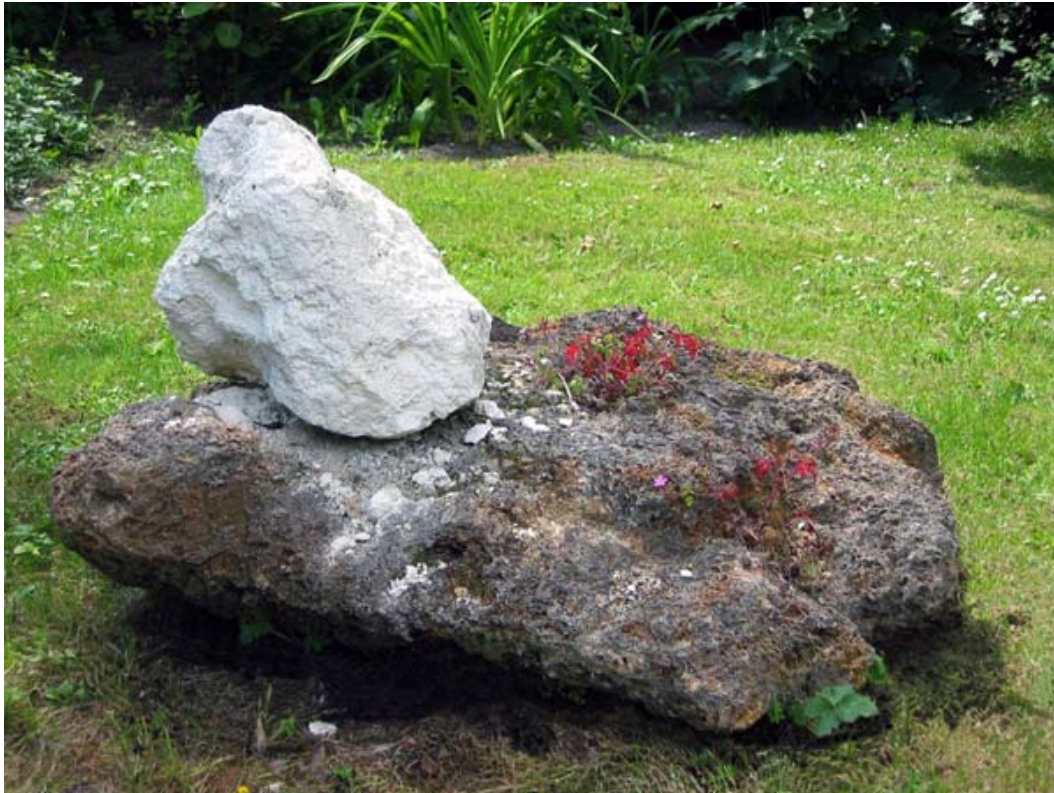
26. Material/Immaterial II , 2000 Activated September 2000; photographed 2002 Spring and aged calcstone, 20 x 42 x 25 inches The Museum of Contemporary Art, Roskilde, Denmark