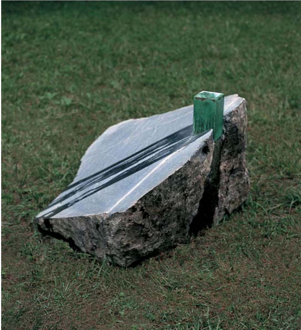
11. Notation V , 2000 Activated and photographed May 2000 Alberene soapstone, copper, ammonium chloride copper sulfate solution, water 27 x 45 x 34 inches; Collection of Beatrix Ost and Ludwig Kuttner, Keene, Virginia