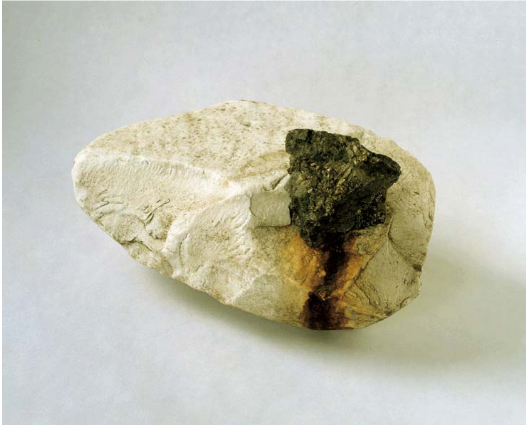
13. Indeterminacy I , 1994 Activated November 1994; photographed January 1996 Carrara marble, pyrite; 9 x 17 x 11 inches; Collection of Kristen & Stephan Mordhost, Copenhagen