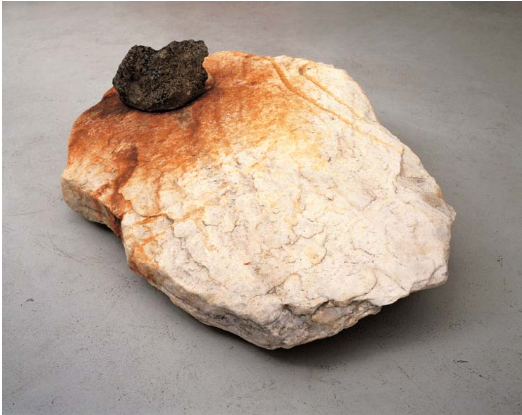
16. Indeterminacy IV , 1995 Activated June 1995; photographed October 1995 Vermont marble, pyrite, 17 x 54 x 38 inches The Museum of Contemporary Art, Los Angeles

Opposite page: 17. Indeterminacy II , 1995 Activated June 1995; photographed October 1995 Vermont marble, pyrite, 31 x 39 x 25 inches Collection of Dr. and Mrs. David Rabinovitz, Kings Point, New York