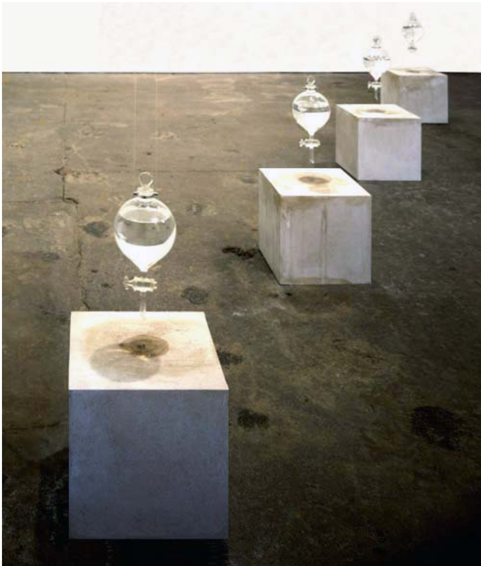
24. Waterstones , 1996 Activated April 1998; photographed January 2001 Limestone: 12 x 12 x 12 inches, 1000 ml dropping funnel, water Installation view: Stark Gallery, New York, 2001; Collection of the artist