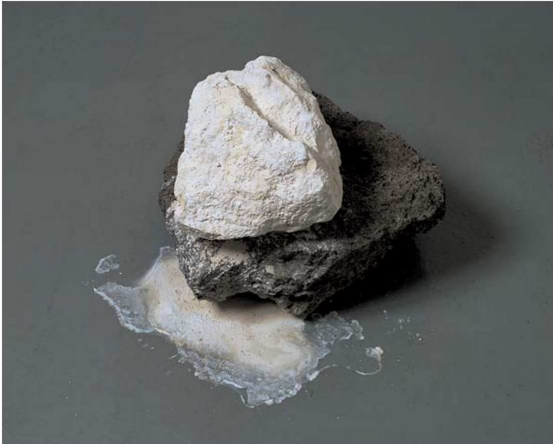
25. Material/Immaerial I , 2000 Activated September 2000; photographed January 2001 Spring and aged calcstone, acetic acid, 10 x 16 x 16 inches; Collection of the artist