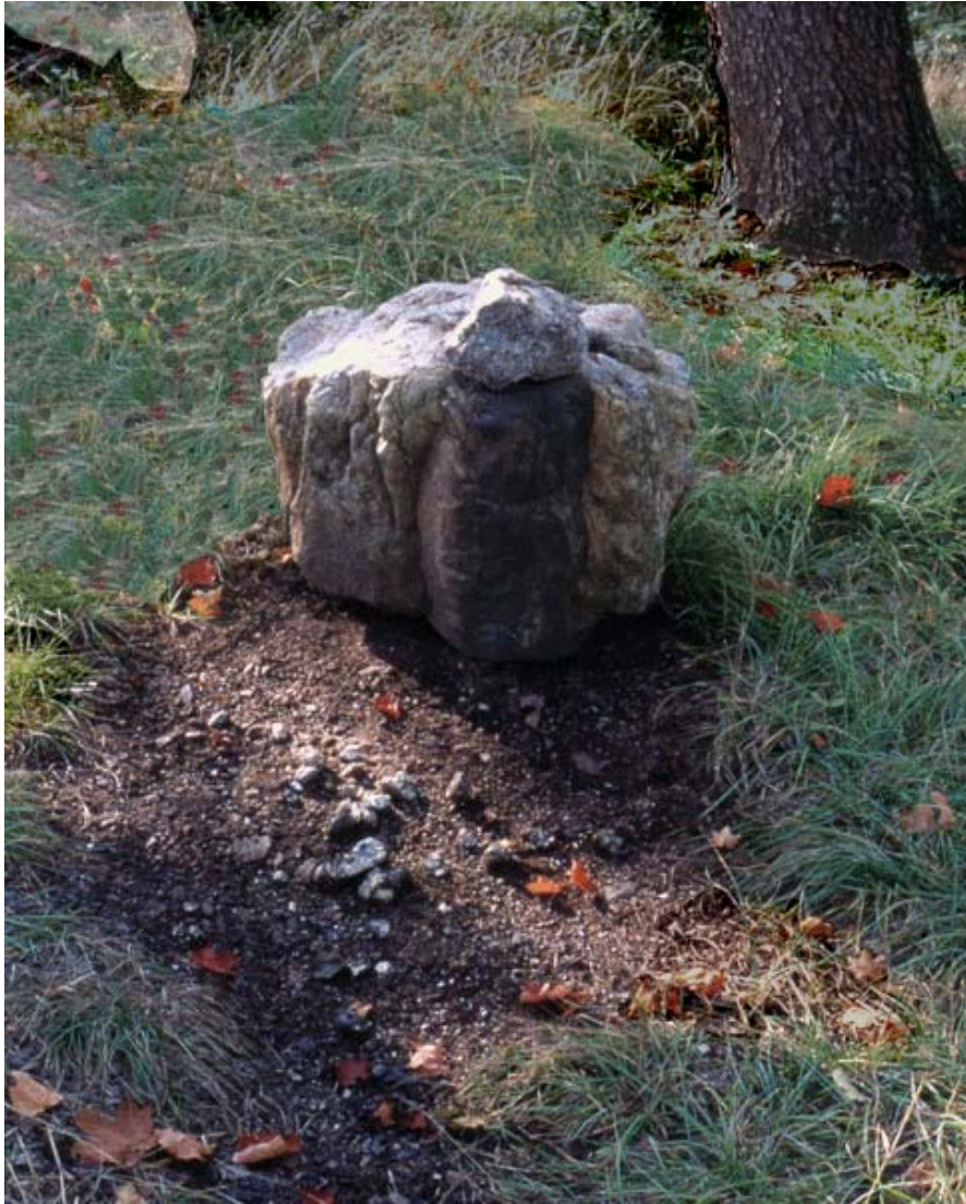
21. Indeterminacy XVI , 1997 Activated July 1997; photographed August 1998 Quartz, pyrite, 34 x 38 x 35 inches; Collection of the artist, Laporte, Pennsylvania